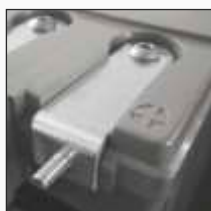
Option B: M6 male front terminal adapter