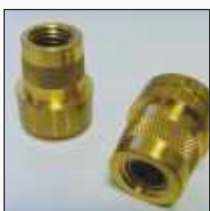
Option A: SAE post